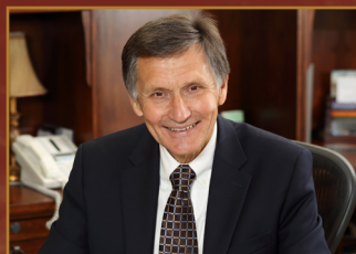
HCJB Global President