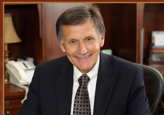
HCJB Global President