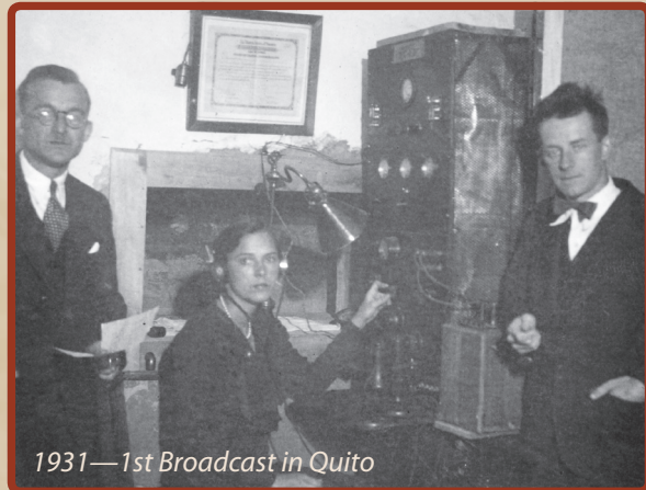
1931—1st Broadcast in Quito

In addition, the mission founded hospitals in Quito and Shell to minister to the physical needs of the poor and outcast.