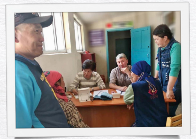
A medical caravan helped build trust with villagers in an undisclosed country.

We have some stories and updates we want to share with you, but because of security for our teams and strategies, we can't tell you where these are happening. We celebrate that God is at work throughout the world in hard-to-reach places!