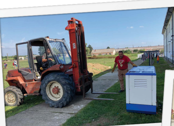
ABOVE: Team members repaired a Romanian partner's forklift, allowing them to move heavy loads and complete jobs that could not be done previously.

As the trip ended, two individuals expressed their interest in serving with Reach Beyond in the future. One is a nursing student who communicated a desire to return to Greece next year to support one of our partners in Athens.