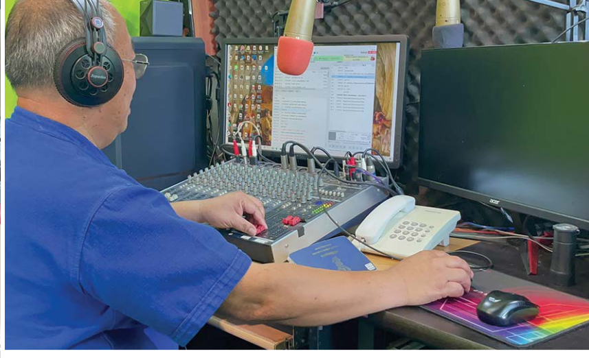
* EDITOR'S NOTE: All names and locations changed for security reasons.

Chai and Kanda's success in finding Harvest Radio was a work of God. Not long before Chai first heard about the station, no one in his village could find a single radio station. The village sits in a valley with steep green mountains standing between it and the nearest radio tower. Since a radio set must directly "see" a radio tower to receive and broadcast its signal (line of sight), Chai's village was completely cut off from all radio broadcasts. But God had a plan.