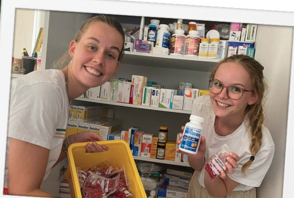
LEFT: Nurses from a Reach Beyond Netherlands team helped organize large numbers of donated medical supplies for a Greek ministry partner that runs a medical clinic.